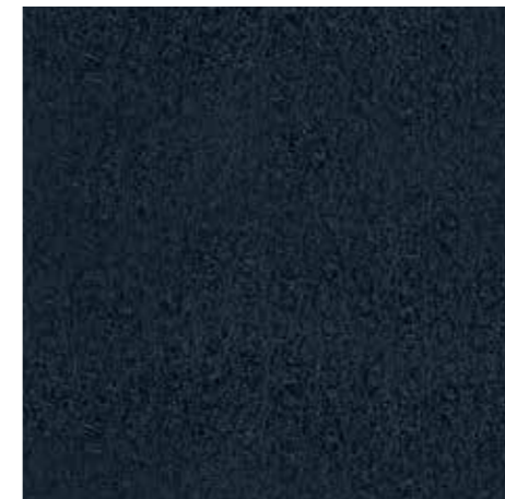
Midnight 5051 (OUT OF STOCK)