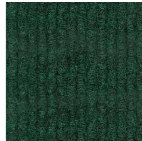
Forest Green 3517