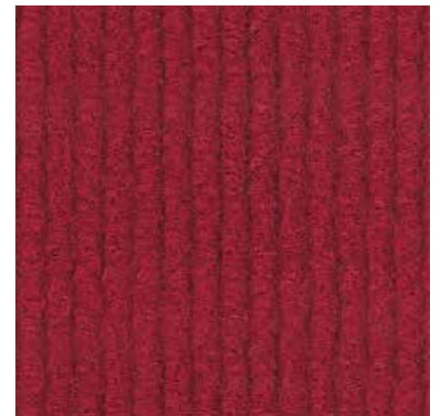
Dark Red 3555