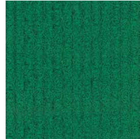
Saxon Green 3534